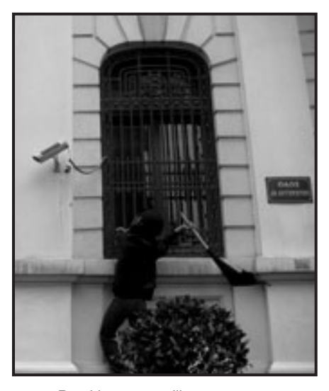
Breaking a surveillance camera Crete, Greece 2008

On February 25, 2004, outside Greece's Labour Ministry, an anti-Olympics demonstration took place that was also in opposition to the working conditions at the Olympic