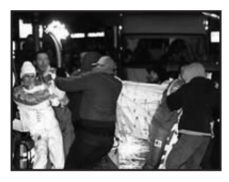
January 2006, anarchists snatch the Olympic torch, Trento, Italy January 2006

The planned route of the Olympic torch was diverted throughout Italy again and again. In Genoa, on December 18, 2005, a blockade forced the flame procession to stop and the flame to be transported in a car. In Trento, on January 23, 2006 the torch was snatched by