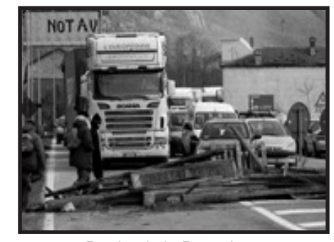
Barricade in Bussoleno

In 2005, construction for the TAV was underway at the mountain sports Olympic venue, Val di Susa. In the winter of 2005, residents of Val di Susa and supporters from many places came together to prevent the TAV by occupying a construction