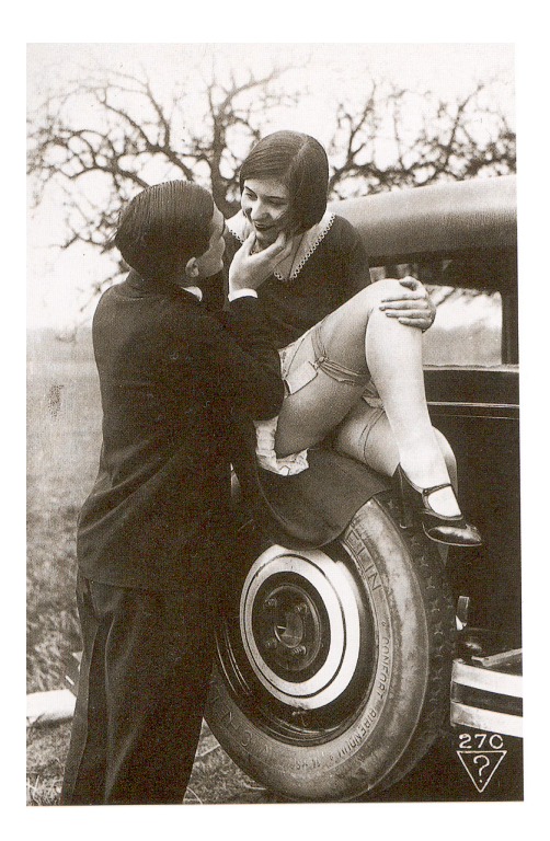
Made in Montreal, Winter 2006.