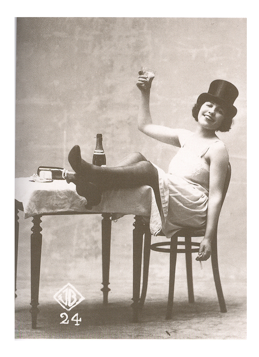
The Diet for a New Vagina!

the pill, you can also opt for the pull-out method.