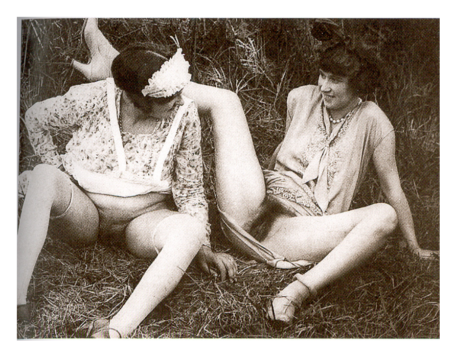
A zine for those seeking a second opinion.